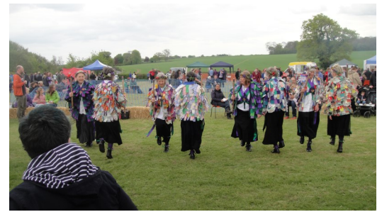
New attraction—The Garston Gallopers—with their colourful costumes.