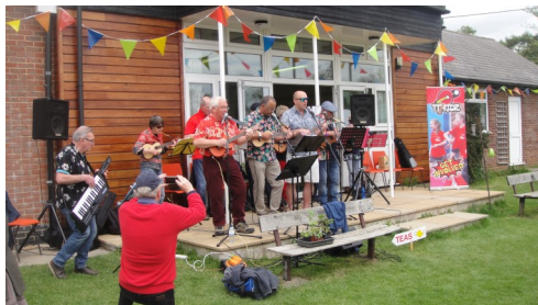
All the way from Peasemore, a lovely noisy group of Ukulele players