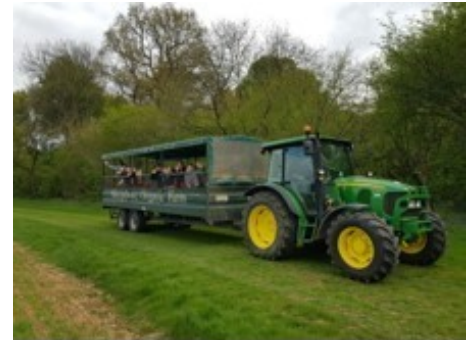
A very popular tractor ride to see the bluebells in Spray Woods