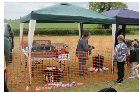
Ferrets were most interesting