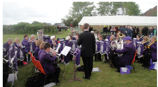
Wantage Silver Band (mind the footballs)