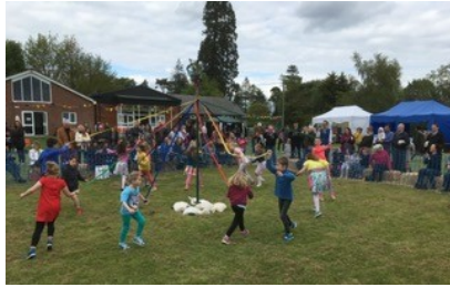
The children enjoyed Maypole Dancing