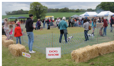
Dogs were also very popular