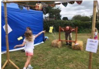
and pelting their teacher with wet sponges