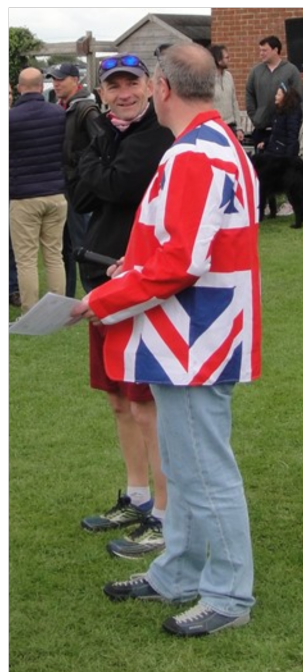
The Voice + Mr. Football