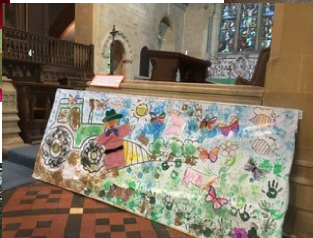
The children worked hard for these displays.