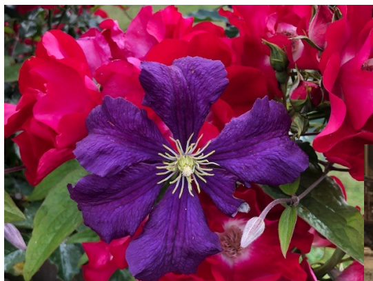
Here are just a few examples of Brightwalton's beautiful gardens

Art Exhibition by Brightwalton Primary School on display in the church