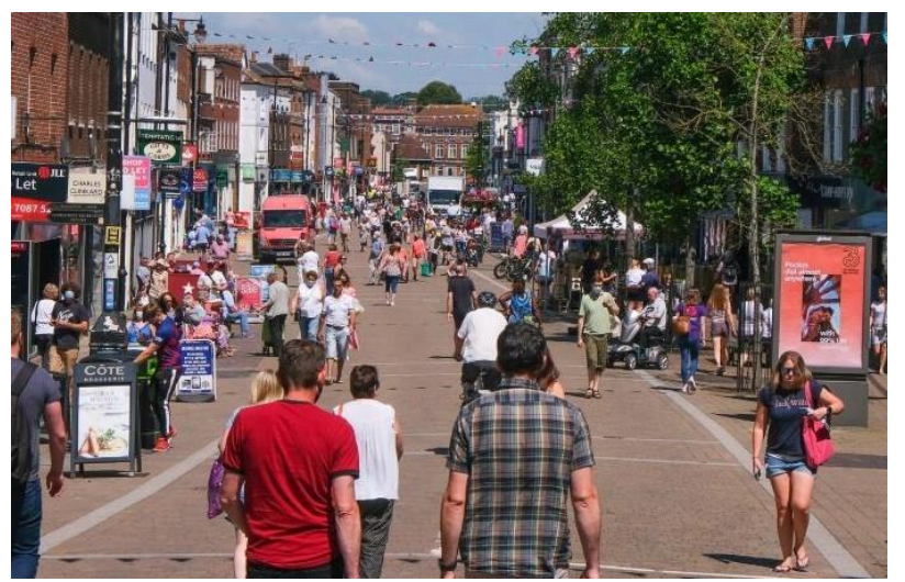
the best chance of success.

The proposal would see the pedestrianised zone, which currently runs from 10am to 5pm, extended until midnight. The trial will last for at least six months with residents invited to share their experiences of the new arrangements in a survey after the trial has started.