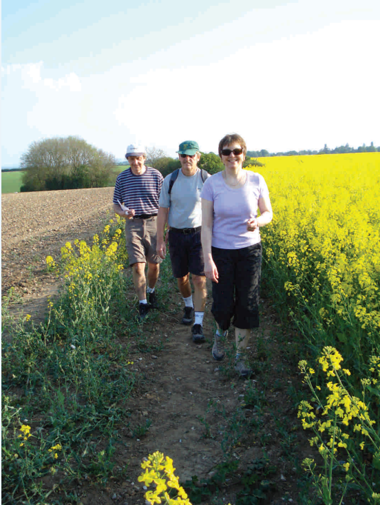
Walkers at Woolley Down

By Field House head west from the common along a bridleway to Nine Acre Wood. Coming down the slope, take the footpath signposted to your right. Cross the road and go up the hill until you come to a crossroads. Turn left here.