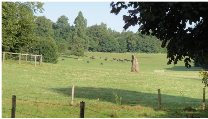
The cows are enjoying the last autumn weeks before they come in to the barn for winter.