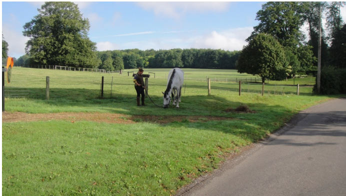
Time to munch some nice green grass