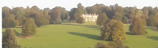
Renovations in progress at Woolley House.