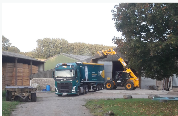
Another load of grain being loaded at Woolley Farm.

And maybe I will mention Covid 19. What a time it has been, but I feel so lucky that we live where we do and have the space to enjoy the countryside. Let us hope that next year things will improve.