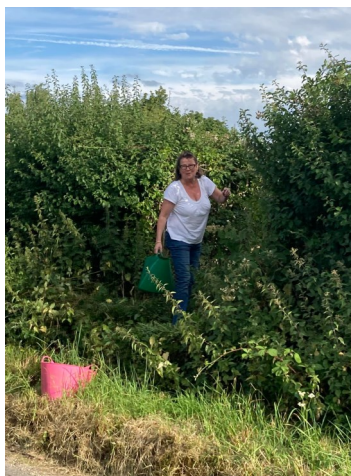
Maintenance at Cherry Tree Avenue

Refreshments will be available to purchase