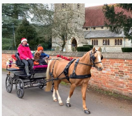
A very Christmassy buggy ride!

It was so sad that the increase levels of Covid in December led to the cancellation of the Benefice Carol Service in Brightwalton on Sunday 19 th December. The choir had practised hard, and we were looking forward to celebrate the Christmas festivities with the new organ and servery in the church, funded by the Aspire project. However, about 50 people came to the short service held around the Christmas tree in the churchyard later that week, and fuelled by delicious mulled wine, enjoyed singing carols and hearing the traditional readings.