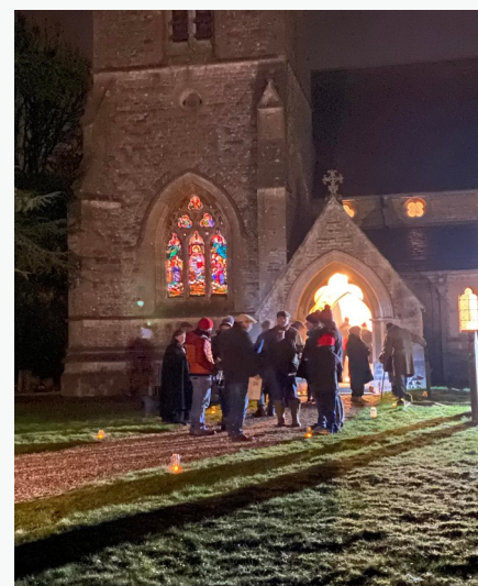
View from outside

And one of the many wonderful Christmas displays this year.